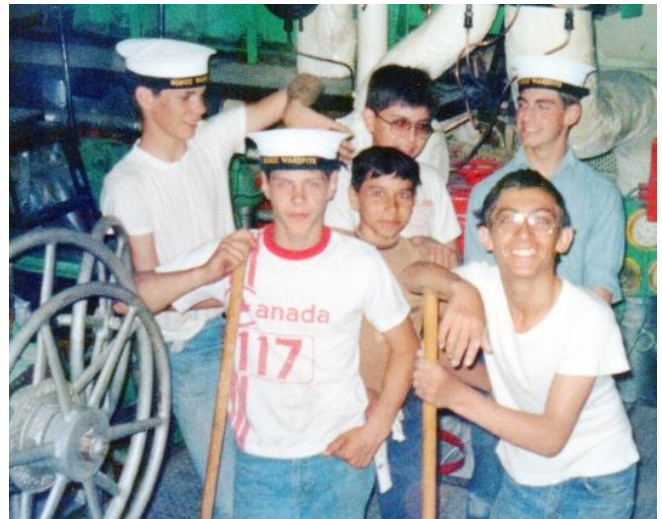
My work party from RCSCC WARSPITE in HAIDA’s Engine Room in 1977.