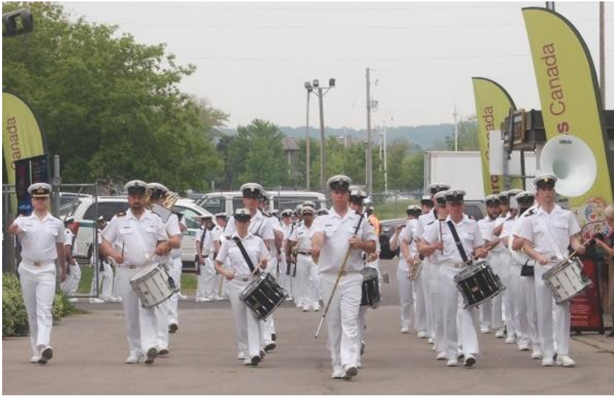
Combined Naval Band from HMCS STAR and HMCS YORK played Heart Of Oak, ending the ceremony.