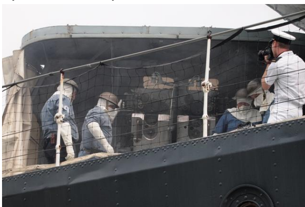
Friend's Of HAIDA's Gunners fired a salvo from the destroyers "A" turret.

The ceremony's came to a close with a salvo fired from HAIDA's "A" turret, followed by the massed Naval Band playing a rousing Heart Of Oak, with many in the happy crowd singing the words of the RCN Anthem aloud.