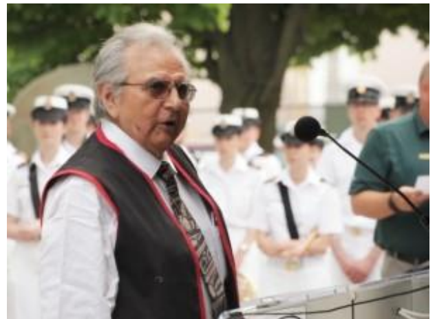
The Haida Indigenous nation were represented by two Hereditary Chiefs at the ceremony. Together they presented the ship with a Haida Nation Flag.