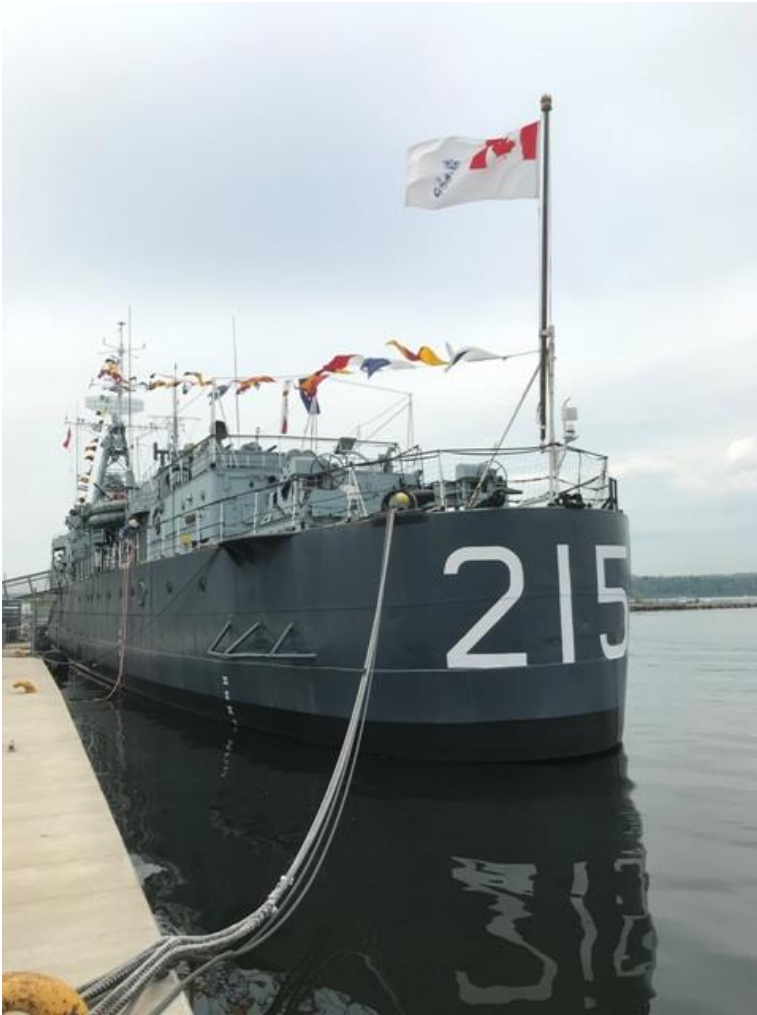
The Naval Ensign fly's from HMCS HAIDA's stern once again.