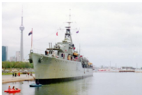
HMCS HAIDA in Toronto in 1977